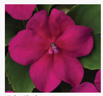
Violet Shades US PAF