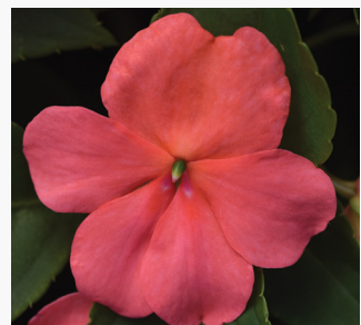
Coral US PAF