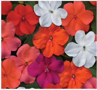
Select Mixture USPAF