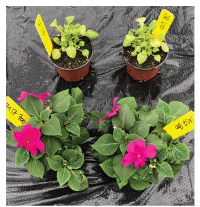
Super Elfin® XP Violet (Top) vs. Beacon™ Violet Shades

Per the definition of High Resistance, plant varieties may exhibit some symptoms or damage under heavy disease pressure. This means it may be possible to see some leaf discoloration and limited sporulation under adverse environmental conditions and high pathogen pressure. Plants may abscise the affected leaves, but the plant will continue to live and thrive.