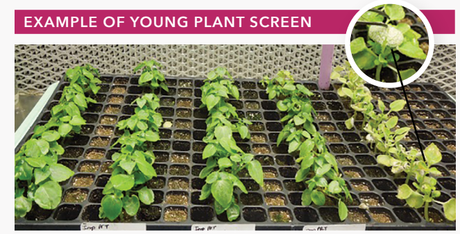
From Left to Right: Four Beacon™ varieties and one Super Elfin® XP variety.