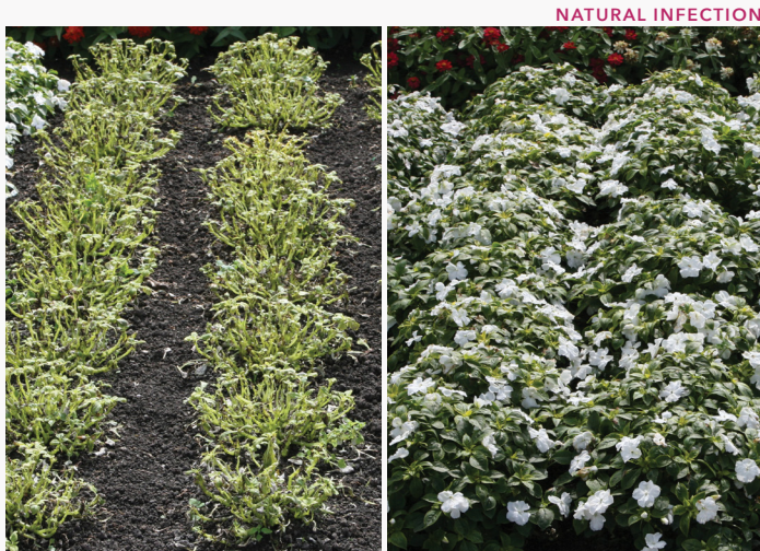
Super Elfin® XP White vs. Beacon™ White

11 weeks after transplant, Beacon™ is thriving, Venhuizen, NL Week 36, 2018