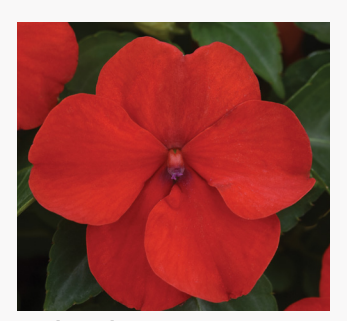
Bright Red US PAF