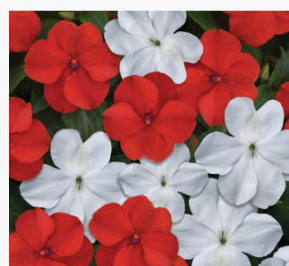
Red White Mixture US PAF

NEW Beacon Impatiens has high resistance to the currently known and widely prevalent populations of Plasmopara obducens , which cause Impatiens downy mildew, offering the opportunity to bring back into production a well-known, in-demand, easy-to-grow and versatile product for gardens and landscapes.