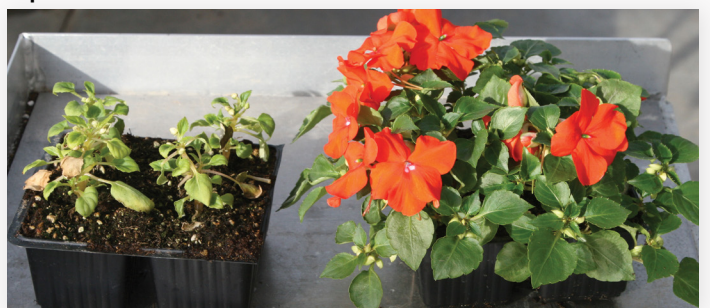
Super Elfin® Bright Orange vs. Beacon™ Orange