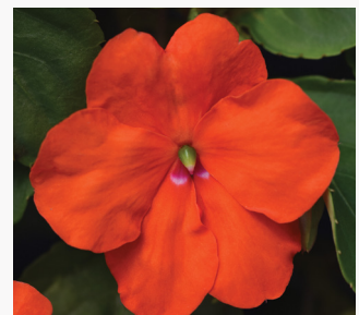
Orange US PAF