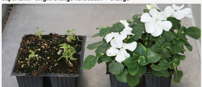
Super Elfin® XP White vs. Beacon™ White

5 weeks after inoculation, Beacon™ is thriving, Elburn, IL Week 31, 2018